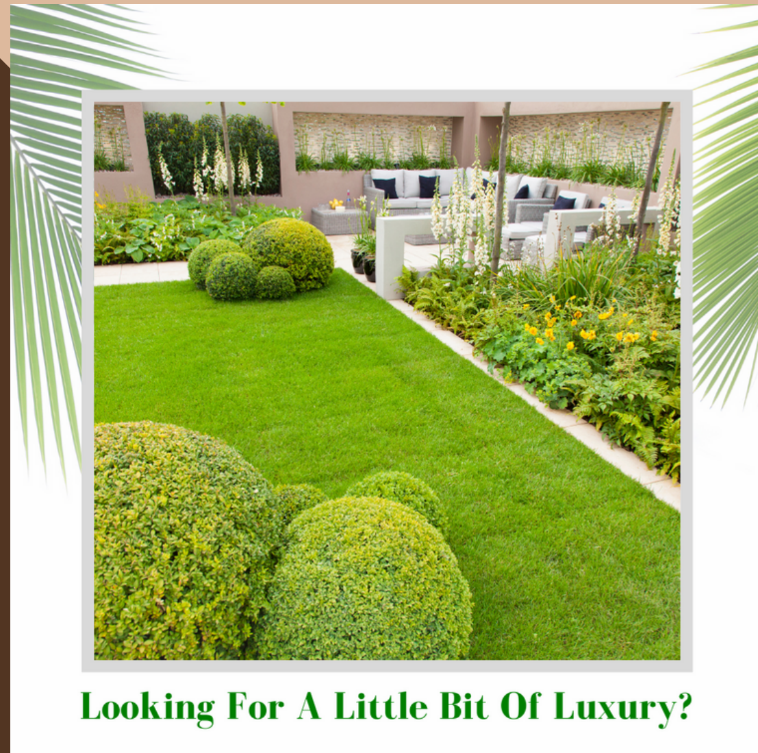
Looking For A Little Bit Of Luxury?